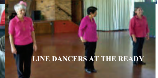
LINE DANCERS AT THE READY