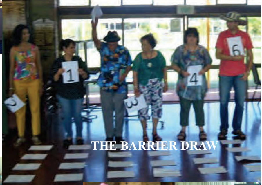
THE BARRIER DRAW